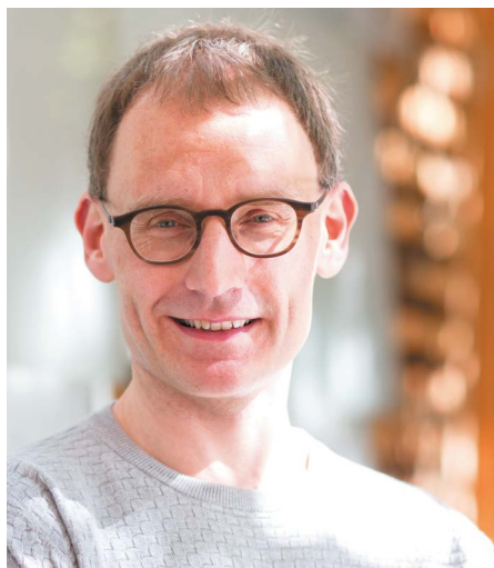
UK epidemiologist Neil Ferguson.

“We're building simplified representations of reality. Models are not crystal balls.”